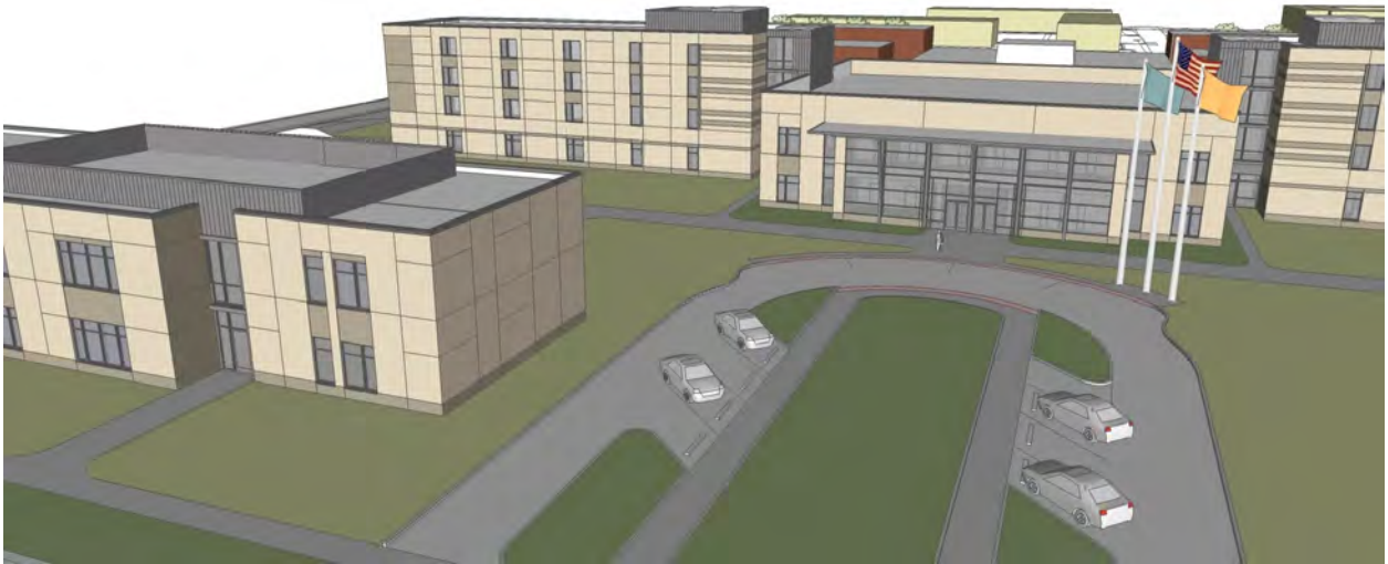
LCA Administration Building rendering

Education Building --a two-story, 17,000 square-foot building that houses classrooms, computer labs, and a library.