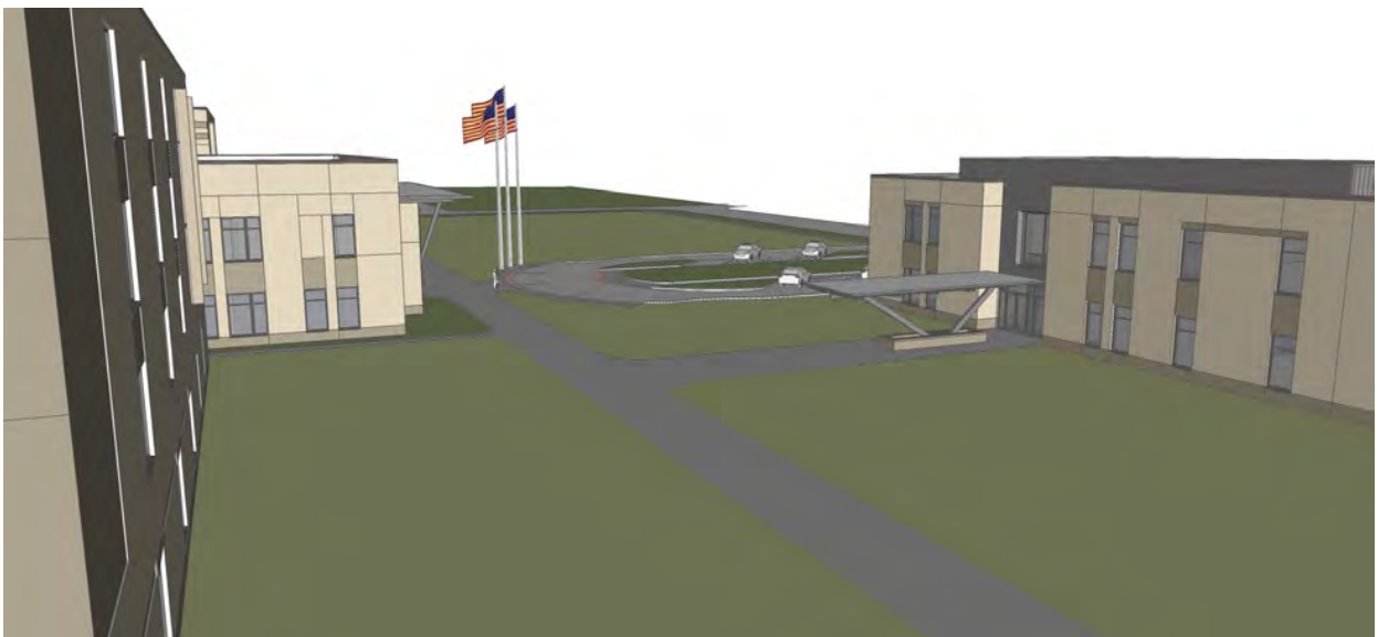
LCA Education Building rendering

For more information visit the LCA website at www.lincolnschallenge.org .