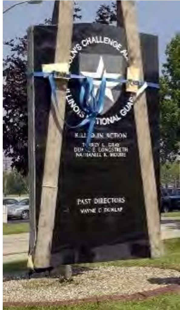
LCA campus memorial