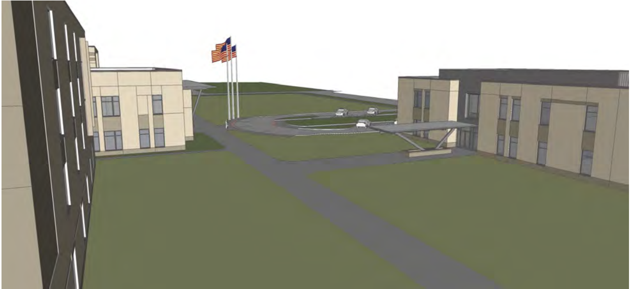
Education Building Canopy Area